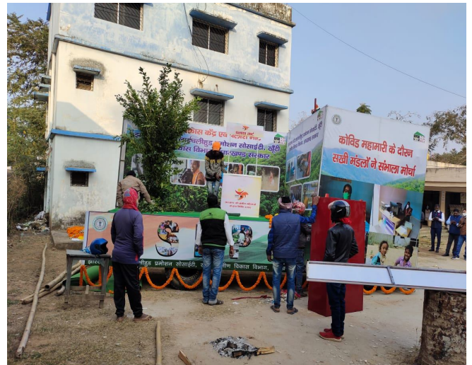
Jhanki on the Eve of Republic Day at Khunti District on the Theme “SHG and Covid 19”