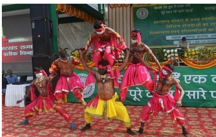
Vikas Mela 2020 at Dhanbad District on the eve of completion of 1 year of Govt. of Jharkhand