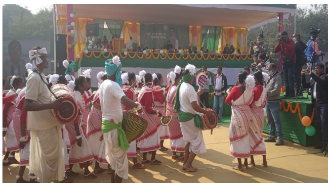
Vikas Mela 2020 at Bokaro District on the eve of completion of 1 year of Govt. of Jharkhand