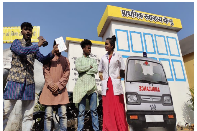
Jhanki on the Eve of Republic Day at Ranchi District on the Theme “Good Samirtan on Road Safety”