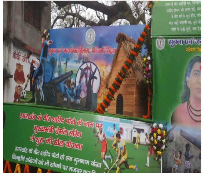
Jhanki on the Eve of Republic Day at Chaibasa District on the Theme “Veer Poto Ho Khel Yojana”